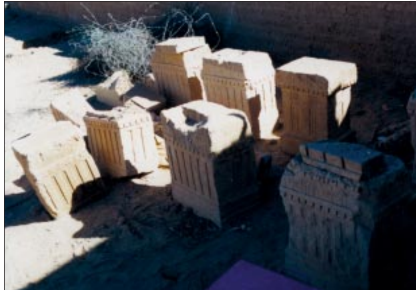
Altar 3, the third altar inscribed with the NHM name, stands in the back row on the right. This altar has been moved to the raised sanctuary of the Bar'an temple.

The altars are not identical. For example, compared to altar 1, altar 2 has more damage to its corners, exhibits 11 rectangular "tooth" shapes below the text on each long side instead of 12, and has five horizontal ridges above the window-shaped recesses instead of four. Likewise, altar 3 has some extensive damage on its sides. Moreover, the text is positioned slightly differently around the sides of all three altars.